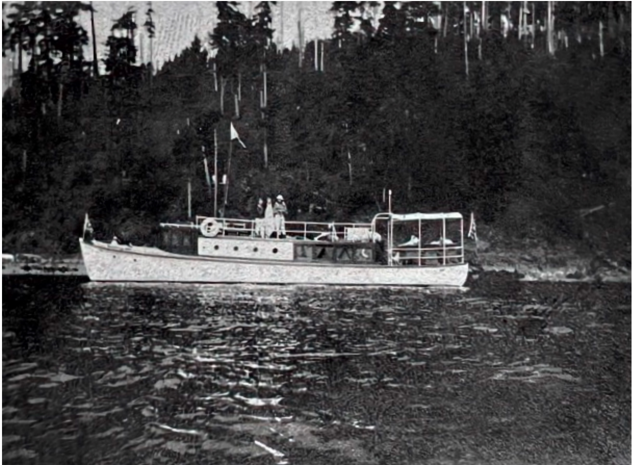
The Sans Souci boat the family used for family outings.