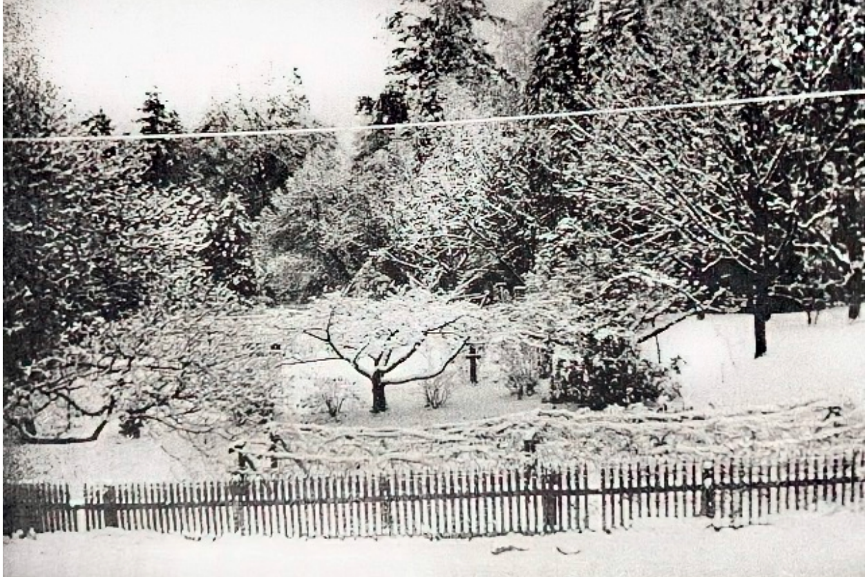
The garden at Sans Souci in winter. The berry trellis is in the foreground, at SW Oregon Street. Note the wide variety of trees both ornamental and fruit bearing.

I also liked to visit my Tante Schmitz often in the big house. Just the two of us. There was a big south facing window in the home where she had all of her houseplants (90 at one time!) and a window seat along the entire length of the room. I always loved the Cougar skin from a cougar hunted in our woods. There was a big porch on the front of the house with a large bell used to call the children to meals.